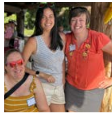
PEPS staff at the LGBTQIA+ family picnic in September.

PEPS Affinity Groups bring together people who share a common identity. These groups can be a place of respite where participants do not have to explain their identity and can show up more fully. We've piloted groups for LGBTQIA+ families, single parents, and working moms. New Affinity Groups are introduced with care and intentionality, taking into consideration the need, the local landscape of organizations already supporting specific communities, and staff capacity.