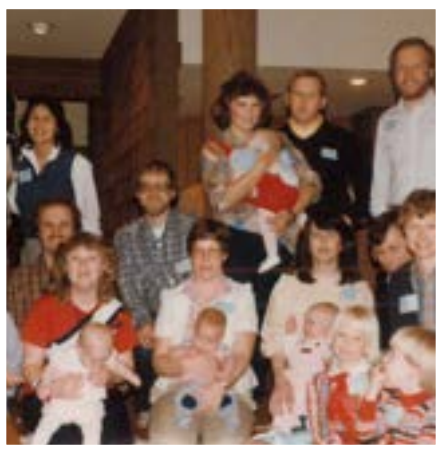
A PEPS Group gathering in 1984.