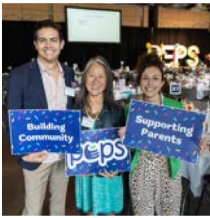
500+ PEPS supporters celebrated 40 years of PEPS at our Birthday Bash.