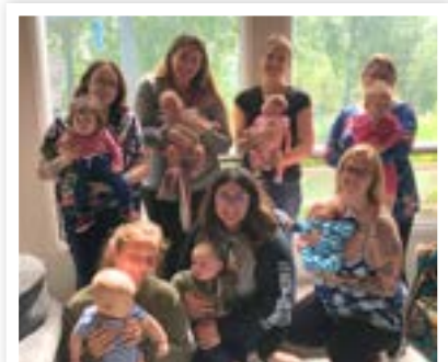
Moms and babies gathered for an EPSA parent peer-support group meeting.